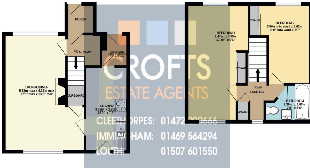
1ST FLOOR 34.2 sq.m. (368 sq.ft.) approx.

TOTAL FLOOR AREA: 69.6 sq.m. (749 sq.ft.) approx.